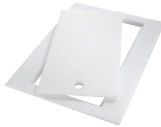
HPDE Twin chopping board 8644 101