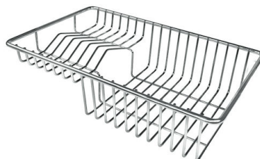
Stainless steel plate rack 8100 303 * only in combination with the accessory 8644 101