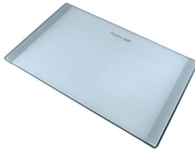
Glass chopping board 8633 300