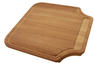
Iroko-wood chopping board 8646 000