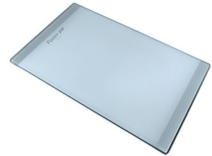
Glass chopping board 8631 300